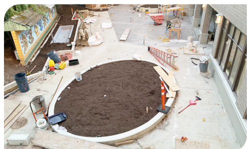
A snapshot of the ground floor courtyard. 位於地下的無障礙庭園之一角。