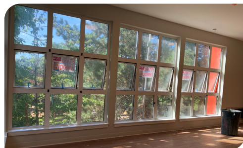
A viewing lounge on each floor of the West Pavilion. 每層樓都會有一個光線充足的觀景室。