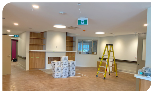
TV lounge of one resident neighbourhood. 每個長者屋苑的獨立電視廳。