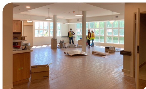
A peek of one of the resident dining rooms. 其中一個長者屋苑的獨立飯廳。